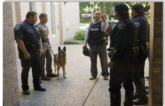
Figure 3: Search team prepares to enter Jester residence hall