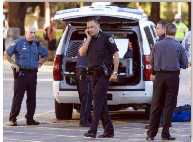
Figure 5: Lt. Gonzalez and APD Chief Art Acevedo at the initial command post

The OSC directed the building searches for the possible second suspect and assigned law enforcement teams to clear the buildings within the perimeter. The OSC had two scribes that recorded the agencies, and names of officers in each team. They assigned each building and recorded the time the team was deployed and the time they returned to the command post. The intention was to assign a UTPD officer with each team because they could provide familiarity with the location and the layout of the buildings being searched. The OSC kept the unified command apprised of the teams' progress. The search continued for approximately three hours. The unified command continued to monitor activity, set objectives, supply operations and logistics with resources, and work to complete the radio patches to a common channel.