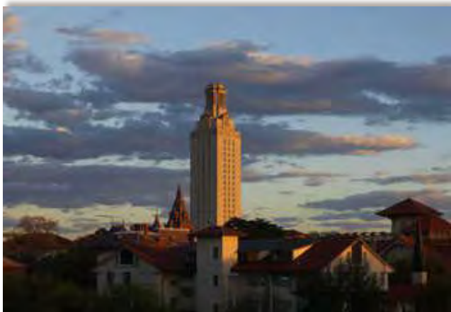
Figure 2: The university Tower at sunrise

The university's reach goes far beyond the borders of the main campus with satellite campuses and research centers across Texas, including the J.J. Pickle Research Campus and the Brackenridge tract in Austin, the Marine Science Institute in Port Aransas, and the McDonald Observatory in Fort Davis, Texas.