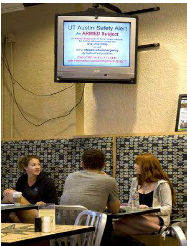
Figure 10: UT Safety Alert on campus closed cable

(campus closed cable), AtHoc (desktop notification), Emergin (paging system) and the University Emergency Website.