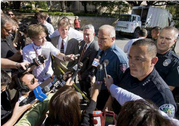
Figure 13: President Bill Powers, Mayor Lee Lefingwell, UTPD Chief Robert Dahlstrom, and APD Chief Art Acevedo conduct a press conference near the scene

The next press conference was conducted at approximately 1 p.m. at the AT&T Executive Education and Conference Center. This location was one of two locations (LBJ Library is the second location) pre-chosen for press conferences for any major event on campus. These locations were chosen because the buildings are equipped with the necessary technology, parking is accessible to satellite trucks and other press vehicles, and both locations are also on the outer edge of campus for easy ingress and egress for the press corps.