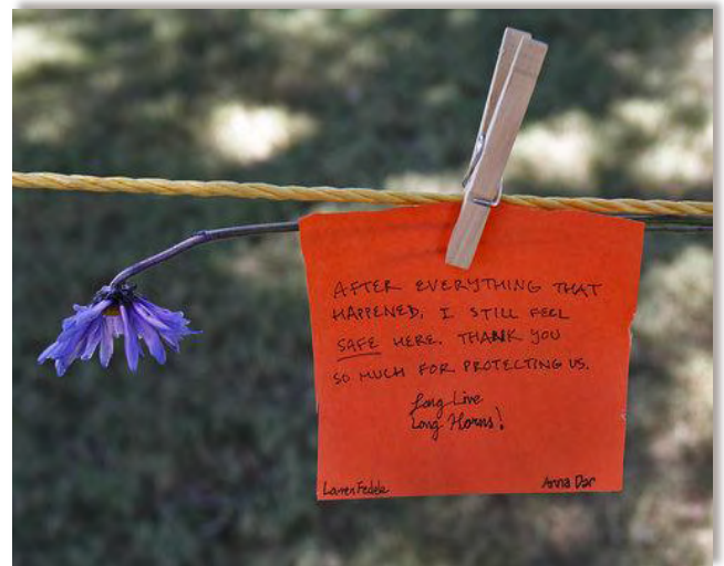
Figure 16: Thank you notes to law enforcement line the campus West Mall

The overarching reason for the successful management of this event was made clear in every area's review—effective collaboration among multiple law enforcement agencies made possible by regularly training together. Training facilitates these working relationships. This report also identified many lessons learned, and we have started to address the challenges and implement some of the recommendations as they relate to personnel, training, procedures, equipment, and technology.