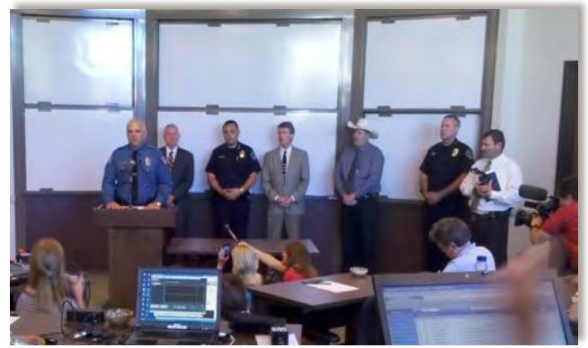
Figure 14: UTPD Chief Robert Dahlstrom speaks to the media at a press conference in the AT&T Executive Education and Conference Center

Over the next two days, the UTPD Chief of Police conducted approximately 10 interviews each day. Most news stations preferred a one-on-one interview.