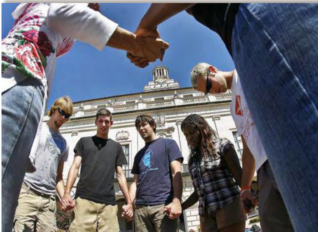
Figure 15: Students gather for vigil September 29