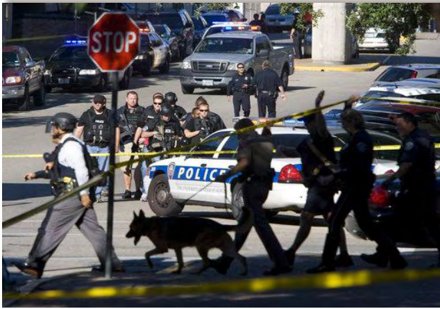
Figure 6 K-9 unit conducting campus search

At approximately 12:20 p.m., unified command shrank the perimeter as buildings were searched and cleared of any suspects. They also developed a demobilization plan that included a staggered release of students, faculty, and staff inside buildings. UTPD used the siren system voice over to direct the release of the community starting with the north side of campus. The command post was closed at approximately 12:45 p.m.