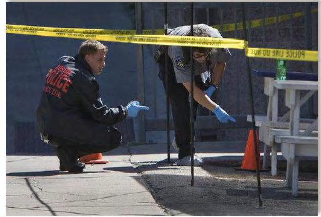
Figure 8: APD and UTPD Officers collecting evidence

A UTPD detective then went to the PCL video room to view the security footage and determine if one or more shooters entered. Staff members from Information Technology Services (ITS) and PCL assisted with obtaining the video footage that verified that only one person with a gun had entered.