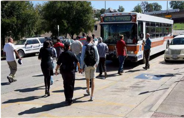
Figure 7: Witnesses boarding a Capitol Metro bus

Officers identified 17 witnesses and moved them to a secure location inside of Gregory Gym, which was adjacent to the incident command post. The APD commander apprised the UTPD sergeant of the assets APD could provide to assist, including a Capital Metro bus and 15 homicide detectives. A plan was made to bus the witnesses to the APD Main Headquarters (less than 1.5 miles away) where the detectives would take statements. While the bus was en route to pick up the witnesses, three UTPD detectives took verbal statements from the witnesses. The detectives tried to determine if there was credible information regarding a second suspect. The witness statements varied but were similar enough to believe there was only a single gunman.