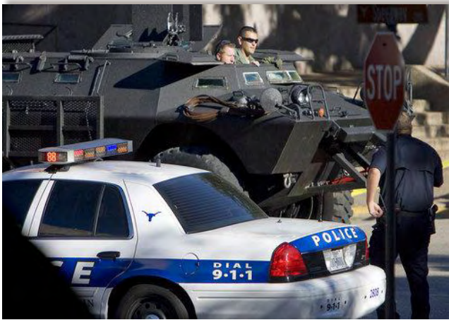
Figure 4: Officers in an APD emergency response vehicle—an “armored bear cat”