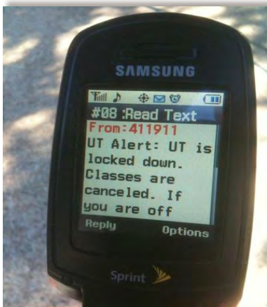
Figure 11: UT text alert

The first emergency call was reported to the UTPD Communication Center at 8:12 a.m. UTPD has two operable dispatch consoles. The primary dispatcher received the first telephone call and the second dispatcher assisted. All units were dispatched immediately. The center was inundated with telephone calls, so additional personnel were summoned to answer calls. The two communication operators concentrated on radio traffic. UTPD had previously trained civilian personnel so in the event of an emergency, they could assist and they did.